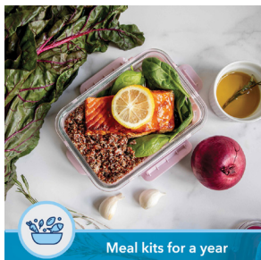
Meal kits for a year