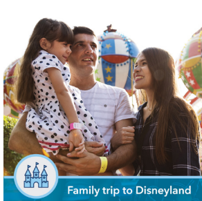
Family trip to Disneyland

You can win 1 of 1,000 rewards to celebrate a full and healthy return to life's activities.