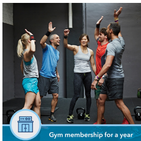
Gym membership for a year