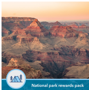
National park rewards pack